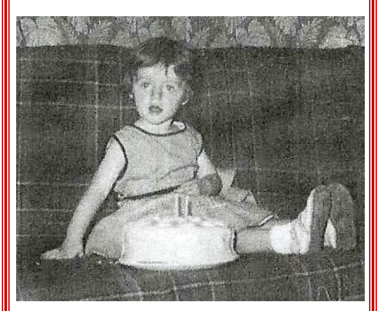
A Very Happy 70<sup>th</sup> Birthday (Sunday, August 27) ~ With much love from your family ~